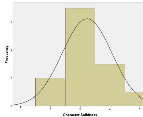
Figure 3. Influence of Character Solidness on FPS

Consequently, concerning RQ_1 (i.e., what are the most important user satisfaction factors for each game genre?), we could state that Character Solidness is the most important factor on gamers’ enjoyment across the genres which collect the appropriate amount of responses, followed by Scenario and Sound . Concerning, RQ_2 (i.e., are there differences among the importance of satisfaction factors across game genres?) we argue that such factors are not uniform across all game genres, but each game type has its specialties that need to be further investigated.